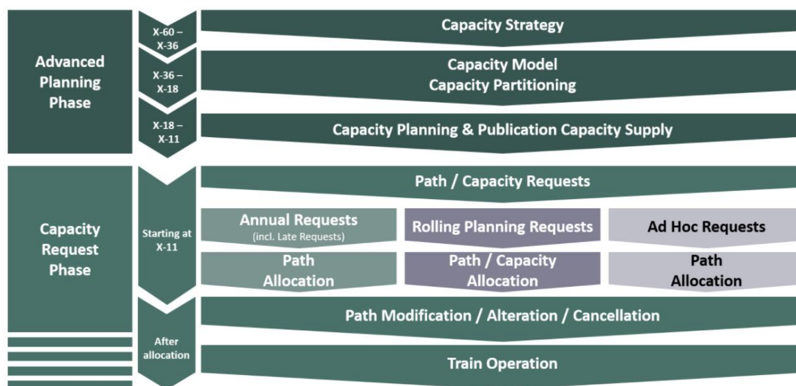
Figure 1: Steps of the TTR process

The Capacity Strategy is the earliest TTR-planning instrument, based on which the Capacity Model (June 2023 for Timetable 2025) and, for some of the first implementing IMs, the Capacity Supply (January 2024 for Timetable 2025) will be developed.